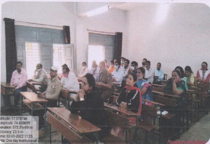
Teaching faculty and Non-Teaching faculty participated in Code of Conduct workshop.